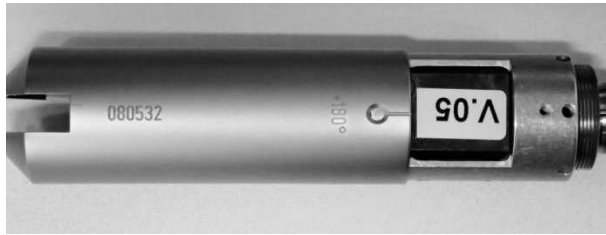
Fig. 3 Measuring probe FT3

The results have been calculated for eight probes. Each probe is identified with a serial number, see Fig.3. Five signals have been taken immediately from each probe.